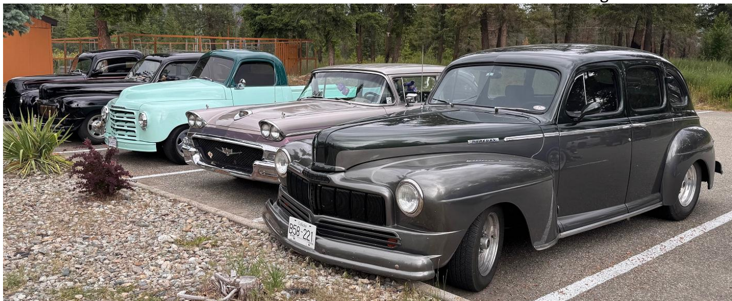
Lunch at the Talking Rock ..... They even had a section for hotrod parking....