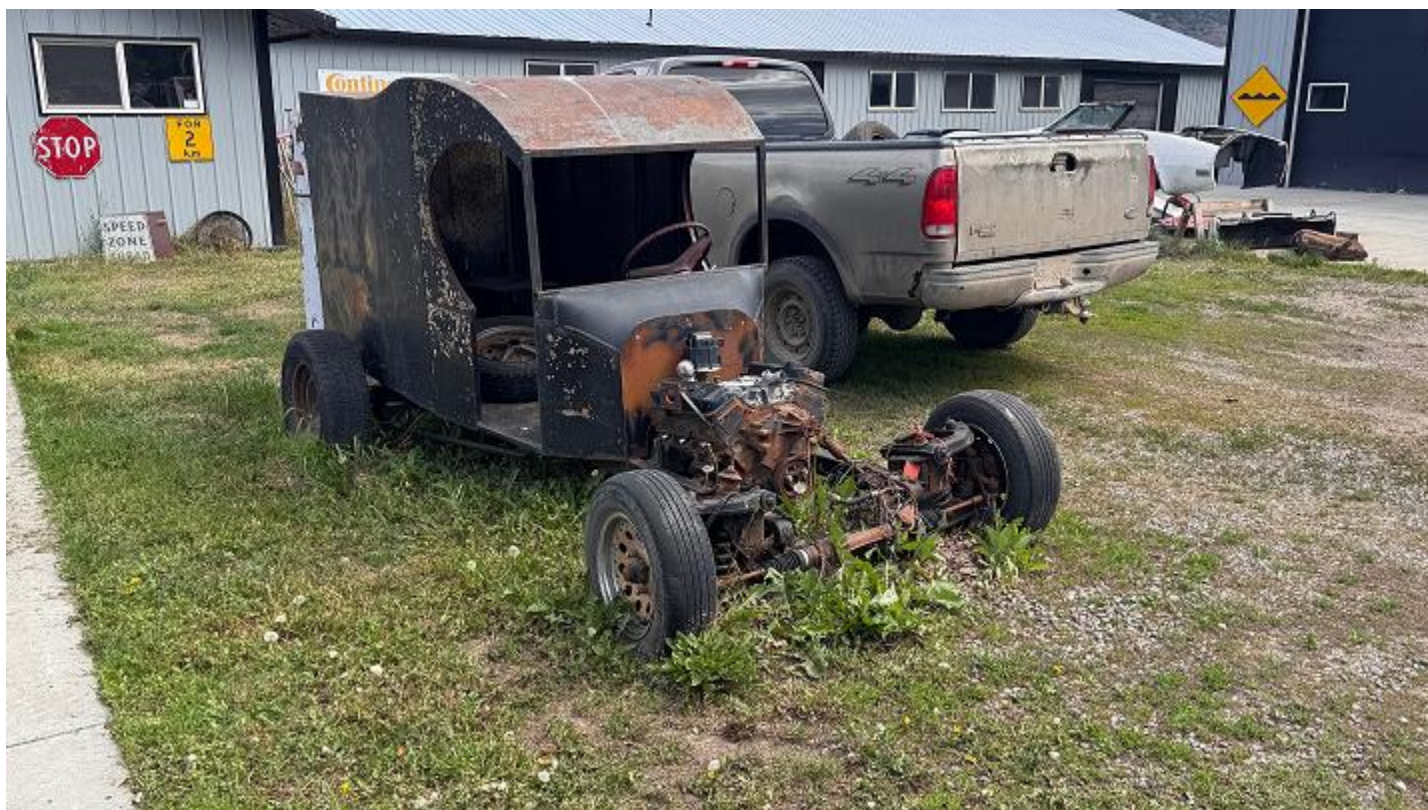
Neat old C Cab from the 70's & 80's ... even had the small V6 that was trending at the time.